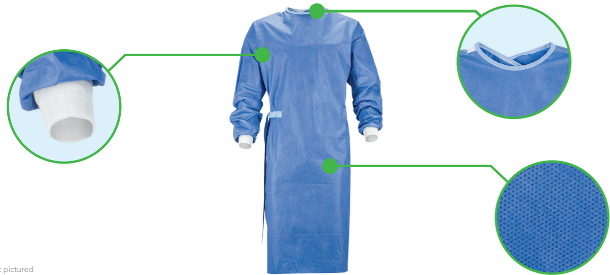
*SMS fabric pictured