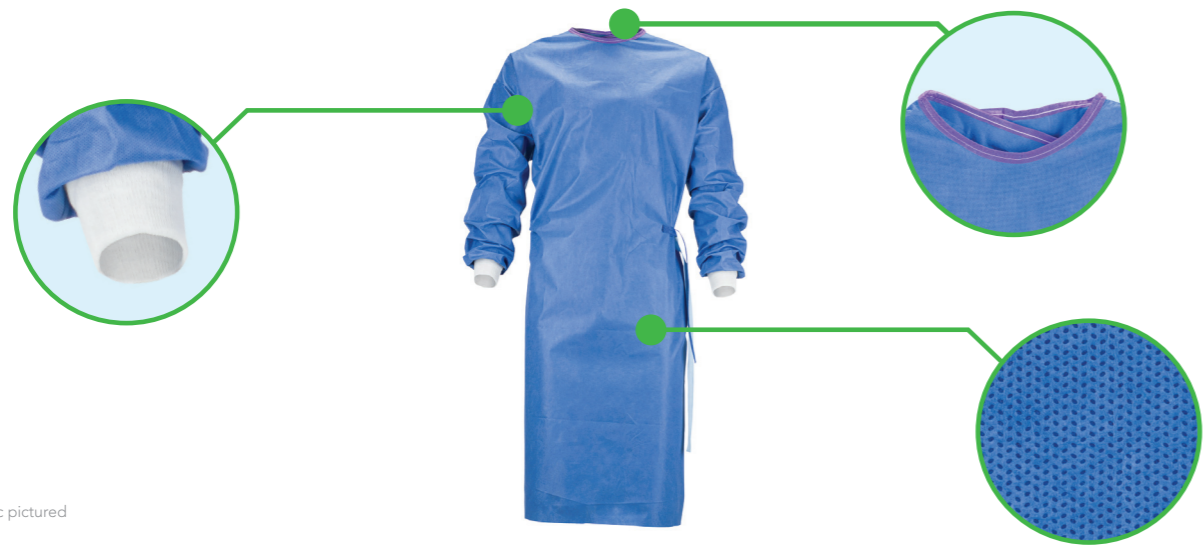
*SMS fabric pictured