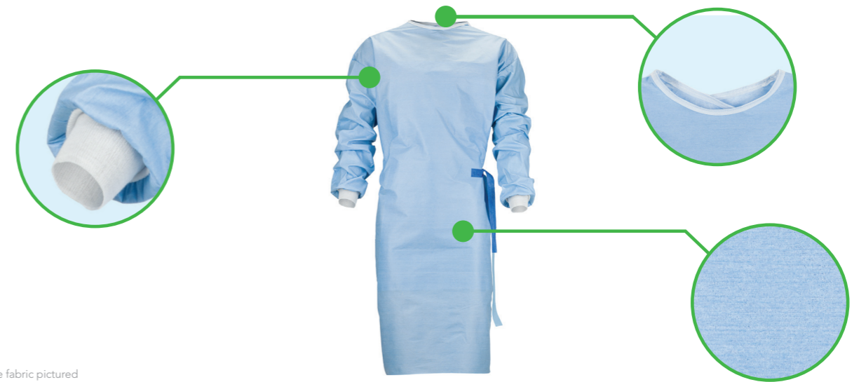
*Spunlace fabric pictured